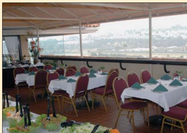
The Small Patio seats 48 people; tables reserved in multiples of 6.