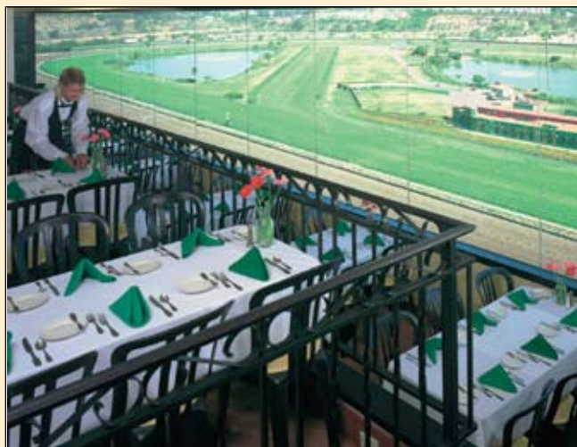
The air-conditioned Il Palio dining room boasts all of the dressy elegance of the Turf Club.

Il Patio, Del Mar's sophisticated, Tuscan inspired restaurant, captures the Renaissance spirit of Italy's most colorful summer festival. Guests of the Il Palio will enjoy the immensely popular Derby Buffet, spectacular views of Thoroughbred racing from the sixth floor and the dressy elegance of the famed Del Mar Turf Club. This luxurious air-conditioned restaurant and its shaded patios, cooled by ocean breezes, define elegant dining. Abundant television monitors, cocktail bars, restrooms and wagering windows complement the Il Palio experience.