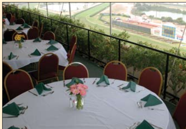
Il Palio's Main Patio accommodates 160 people; tables reserved in multiples of 10.

Il Palio's two canopied patios overlook the track for an exciting afternoon of horse racing and al fresco dining.